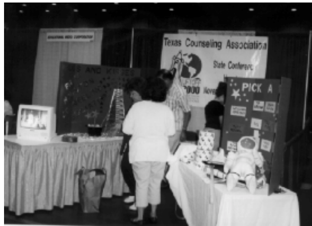
HCA Booth at TCA Conference

The location of this year's HCA Awards banquet will be at the Junior League of Houston at 1811 Briar Oaks, just inside Loop 610 at San Felipe.