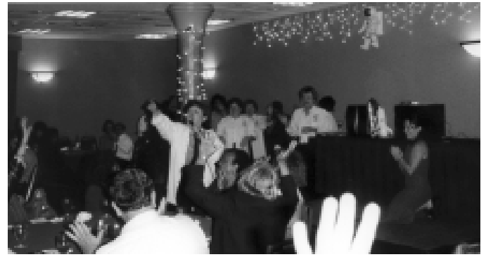
HOUSTON, WE HAVE A CONFERENCE!!! was shouted by all HCA members as we marched through the crowd above and below.