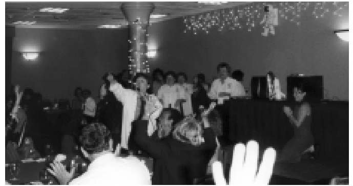
HOUSTON, WE HAVE A CONFERENCE!!! was shouted by all HCA members as we marched through the crowd above and below.