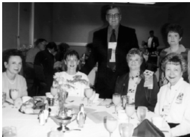
TCA Conference Texas School Counselors Association Breakfast for chapter presidents

Phone: 713-772-6872 Email: billette@fc.net